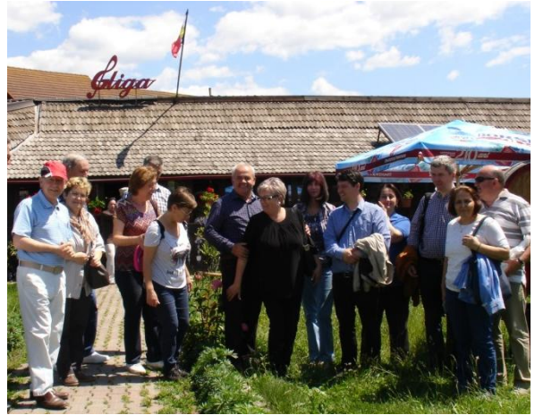
A visit to Gliga Violins at Reghin with the teaching staff from the Faculty of Wood Engineering