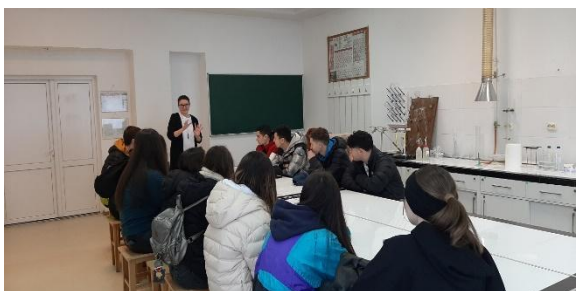
Lab of the Engineering and Environmental Protection Specialization

In the week between 27 February and 4 March, as part of the activities carried out in the Programme "Doing School Differently", two visits took place.