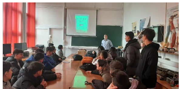
Lab of the Medical Engineering specialization

We thank them for their visit and look forward to seeing them again in October as students of the Faculty of Product Design and Environment!